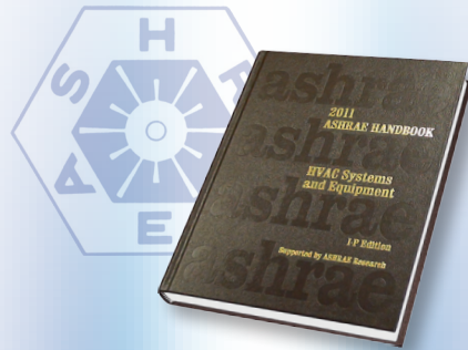
ASHRAE 2011 HVAC Handbook, Chapter 60, "Ultraviolet Air & Surface Treatment"

UV light technology has been recognized for its benefits and energy savings in the following industry and government handbooks: