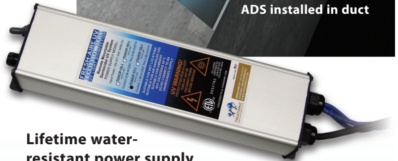
Lifetime water-resistant power supply