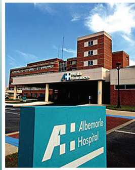
Albemarle Hospital Elizabeth City, N.C.