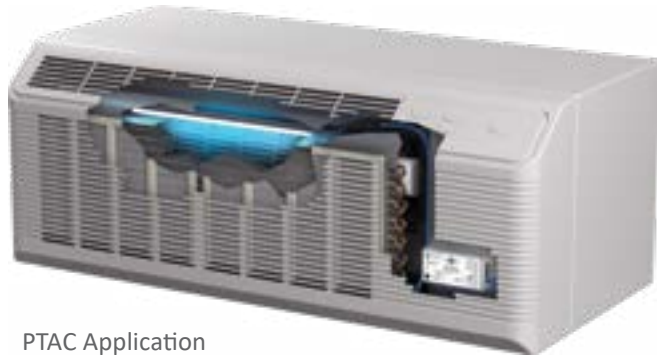
PTAC Application (No light is visible when properly installed)

Protecting our homes and families from airborne infectious diseases has become the highest priority. The unique germ-killing properties of UVC light have been known for over a century. Because UVC in sunlight is filtered by the Earth's atmosphere, microbes (including viruses) have no defense against it. This chemical-free technology is now used for hospital disinfection, food safety, and water purification.