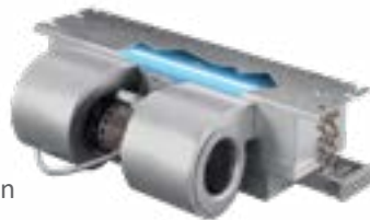
Fan Coil Application