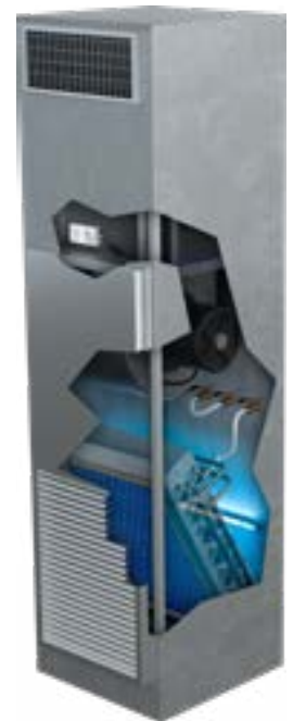
Vertical Fan Coil Application