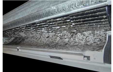
Mold thrives on mini-split blower wheels