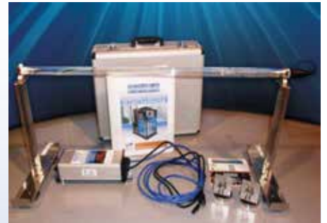
Free UVGI Trial Kit

To start the process Building owners simply provide basic information about their HVAC system. Facilities that meet our criteria will then receive an on-site analysis. The best candidates will be systems with a history of biological growth fouling that have required frequent cleaning . This offer is limited to facilities in the continental US.