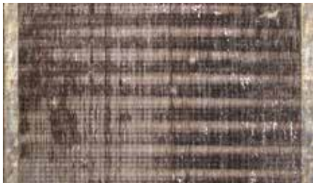
The best candidates will be systems with a history of biological growth fouling

To start the process Building owners simply provide basic information about their HVAC system. Facilities that meet our criteria will then receive an on-site analysis. The best candidates will be systems with a history of biological growth fouling that have required frequent cleaning . This offer is limited to facilities in the continental US.