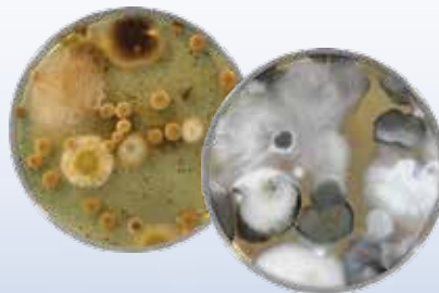
Samples taken at the site reveal the type and extent of biological contaminants

This free trial includes a free site analysis of one of the HVAC systems of your choice at your site. Upon completion, a temporary trial installation of a commercial UV light system will be installed for a period of time.