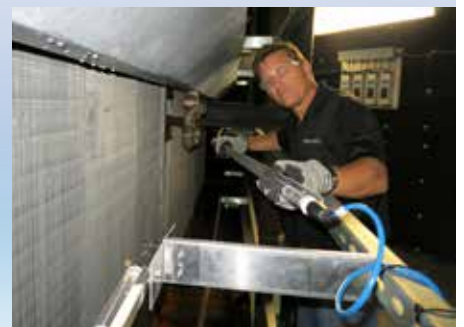
Trial UVGI System installed at no cost to you

This free trial includes a free site analysis of one of the HVAC systems of your choice at your site. Upon completion, a temporary trial installation of a commercial UV light system will be installed for a period of time.