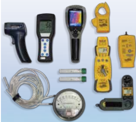
A comprehensive analysis is done on-site