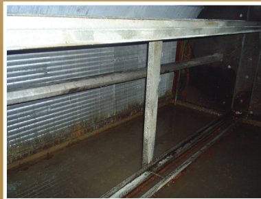
Air Handler Before UV Lights