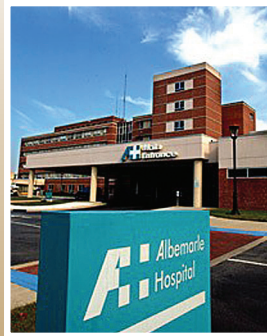
Albemarle Hospital Elizabeth City, N.C.