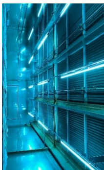
Air Handler Disinfection

For more information on Fresh-Aire UV systems or to discuss your specific application, please contact 1-800-741-1195 or email sales@FreshAirUV.com .