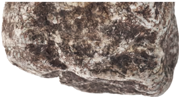
SAND GRAIN 63 - 2000 microns