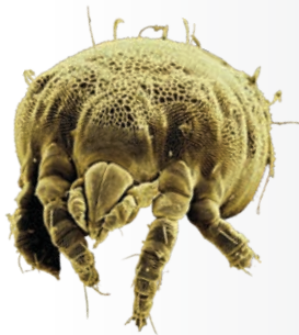
DUST MITE 300 microns

Purity Low Profile captures particulates of all sizes (down to an incredibly small 0.1 microns). It uses an polarized charge to attract and clump particles together making them easier to capture without restricting air-flow.